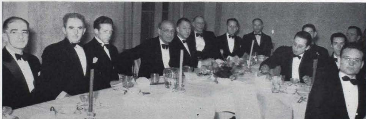
SPEAKERS' TABLE, FRANK PHILLIPS' INITIATION BANQUET, NORMAN, OKLAHOMA