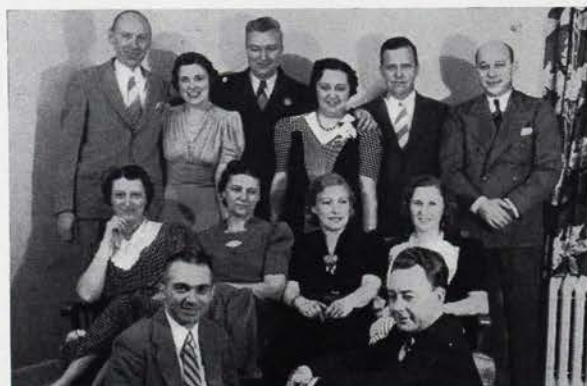
MEMBERS OF THE BALTIMORE DELTA SIGMA PI BRIDGE CLUB