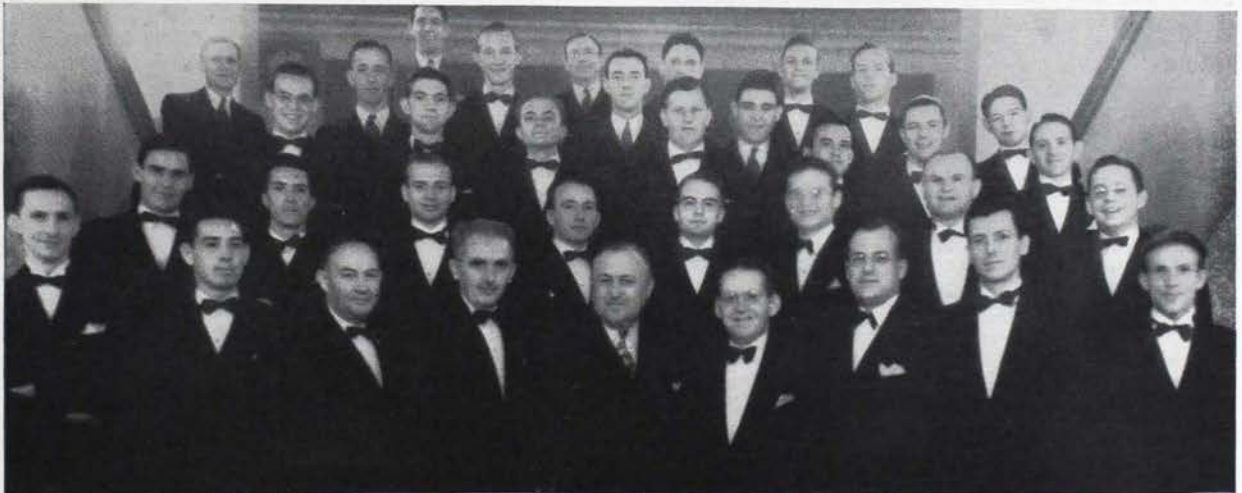
PICTURE OF OUR OKLAHOMA CHAPTER TAKEN APRIL 4, 1940

Second semester activities will be climaxed by Delta Chapter's formal dinner-dance to be held at the Westmoor Country Club on June 8. All the members look toward this evening with pleasure. Alumni and actives get together for an evening of dancing and meeting old friends.