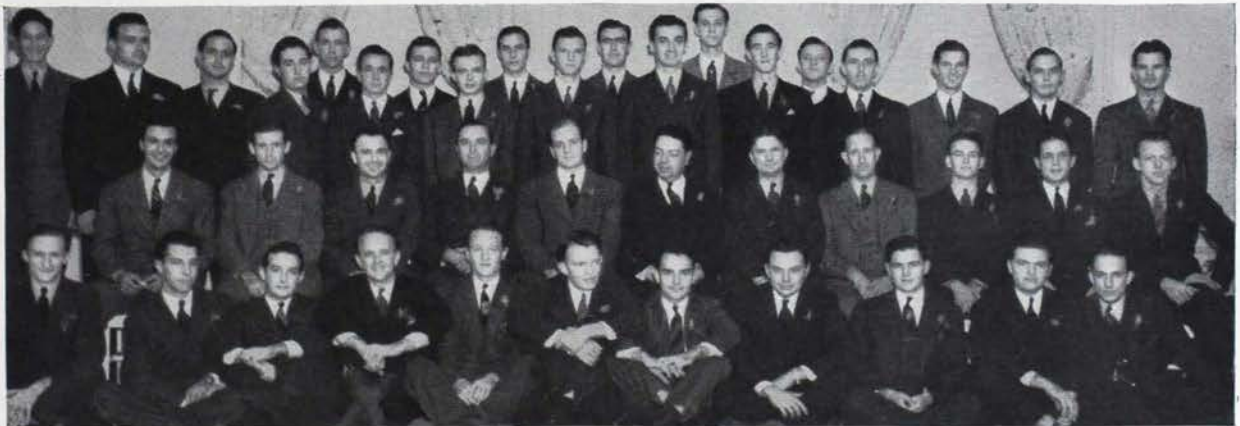
BETA KAPPA CHAPTER—UNIVERSITY OF TEXAS