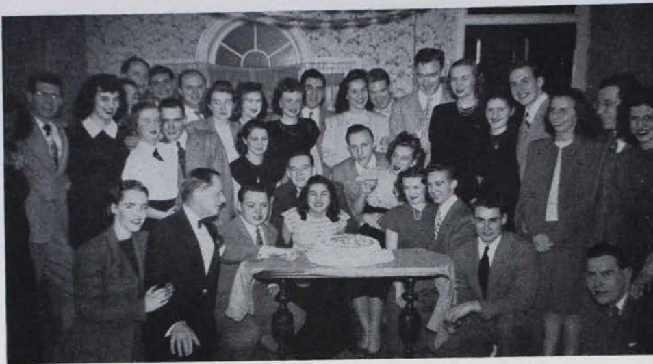
BETA NU CHAPTER, PENNSYLVANIA, BIRTHDAY PARTY which was held at the Chapter House on January 24. The birthday cake was cut by two visiting ladies whose birthday coincided with that of the chapter.