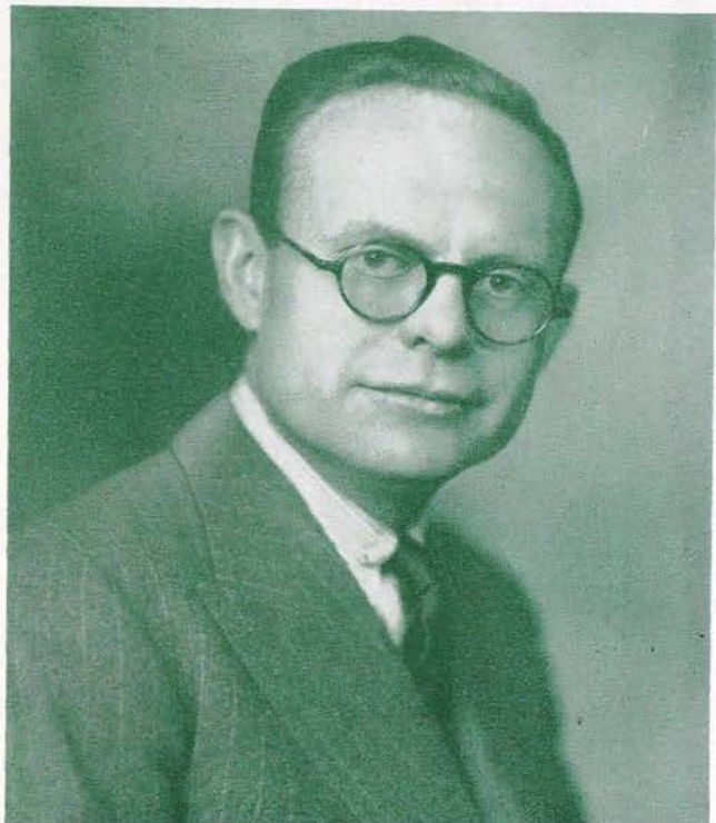
GARDNER COWLES Publisher of Look Magazine, and Honorary Member of Alpha Iota Chapter of Delta Sigma Pi

FOUNDED 1907 * * * * AT NEW YORK UNIVERSITY