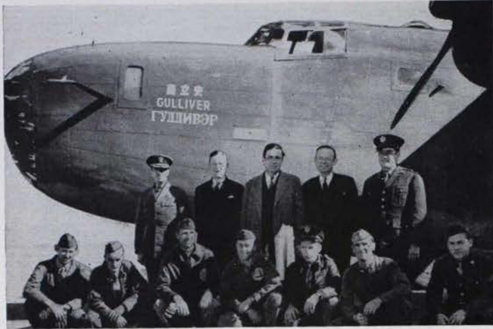
GARDNER COWLES' TRIP AROUND THE WORLD IN 1942 as a companion of the late Wendell Willkie to study international problems and lay the ground work for the present United Nations. He took another such trip in 1947, this time however, with a group of prominent publishers and editors. Gardner Cowles is standing second from the right with the late Wendell Willkie on his left.