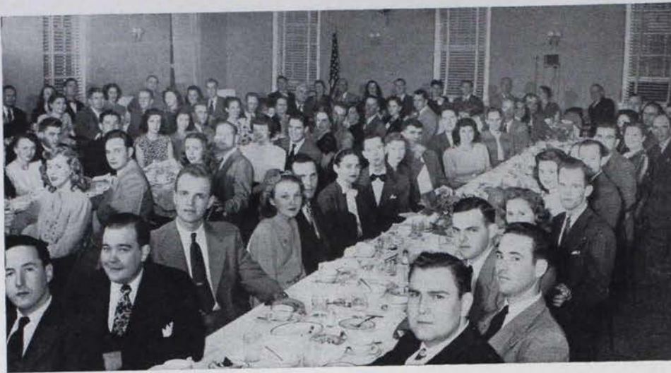
ALPHA SIGMA CHAPTER, ALABAMA, BANQUET which was held on December 4.