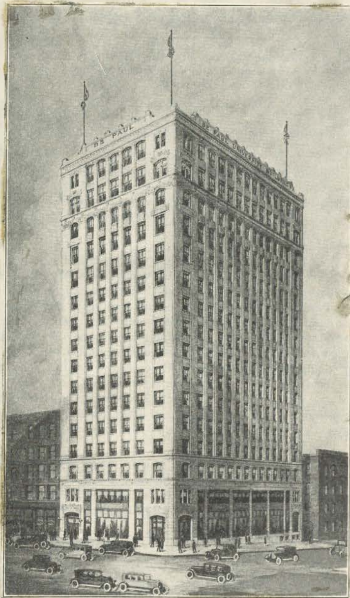
New De Paul University Building.

This building is being erected at Lake Street and Garland Court. It will be sixteen stories high and will house the Colleges of Law and Commerce, as well as the Evening Commerce School and Loop High School. The top six floors will be used for the school. The first ten will rent as office space. This building is to be ready May 1-1928.