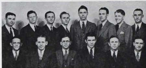
HOUSTON ALUMNI CLUB