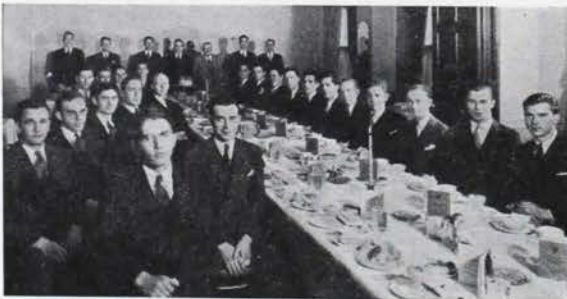
FOUNDERS' DAY BANQUET AT OHIO STATE