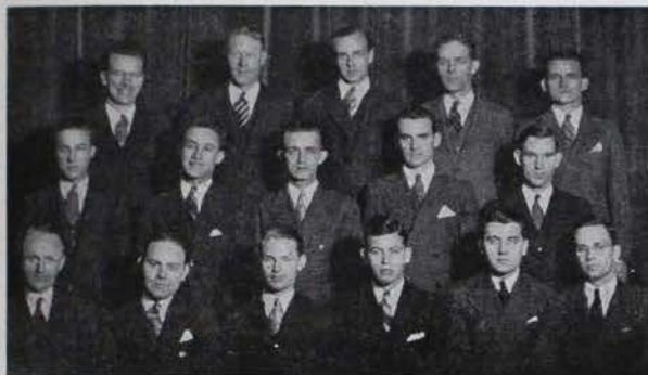
ALPHA BETA CHAPTER—UNIVERSITY OF MISSOURI