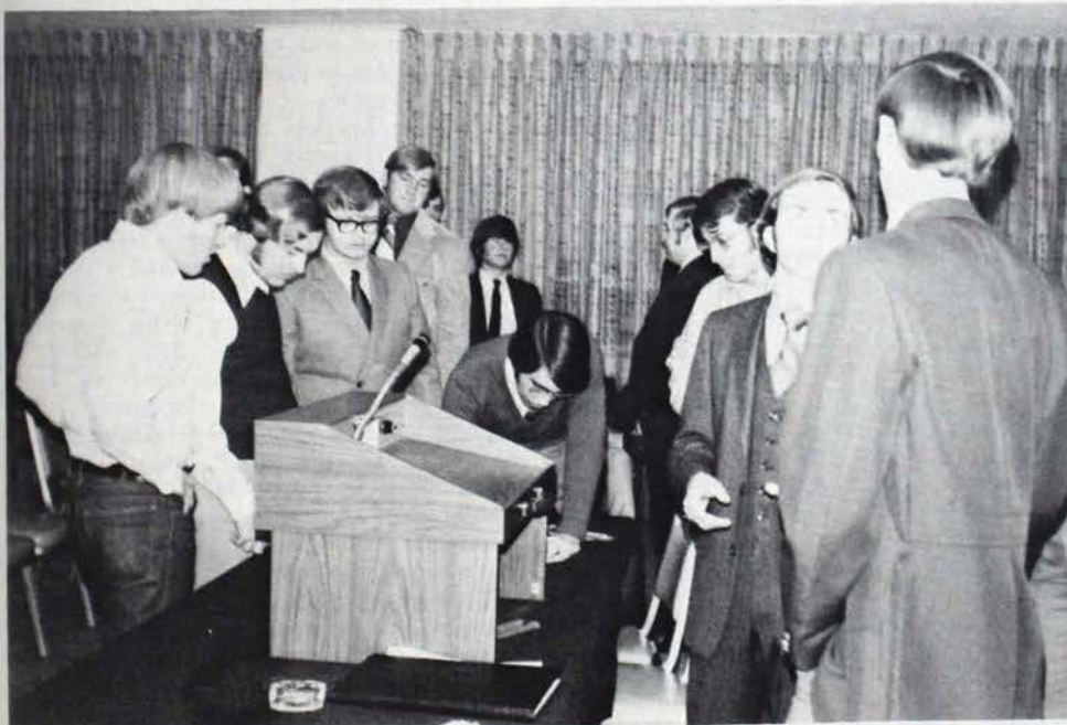
SHOWN HERE IS the informal discussion between members and rushees of Theta Pi Chapter at Bowling Green State University during one of the chapter's recent rush meetings.