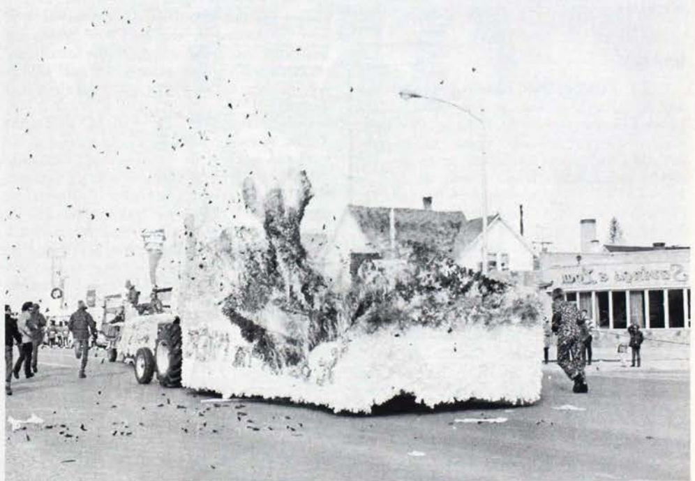
THE HOTTEST FLOAT in the Western State College homecoming parade this year literally was that of Zeta Kappa Chapter. Covered with over 30,000 paper napkins, it showed a WSC football player kicking at an opponent from the Colorado School of Mines. Every time the player kicked, a hidden charge of black powder was ignited with a bang. The biggest bang of all was when the powder ignited the float.