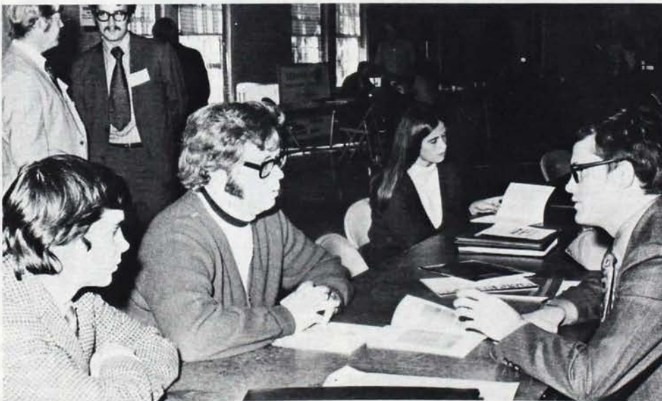
SHOWN HERE ARE some of the members and guests which attended the annual Career Day sponsored by Alpha Iota Chapter at Drake University.