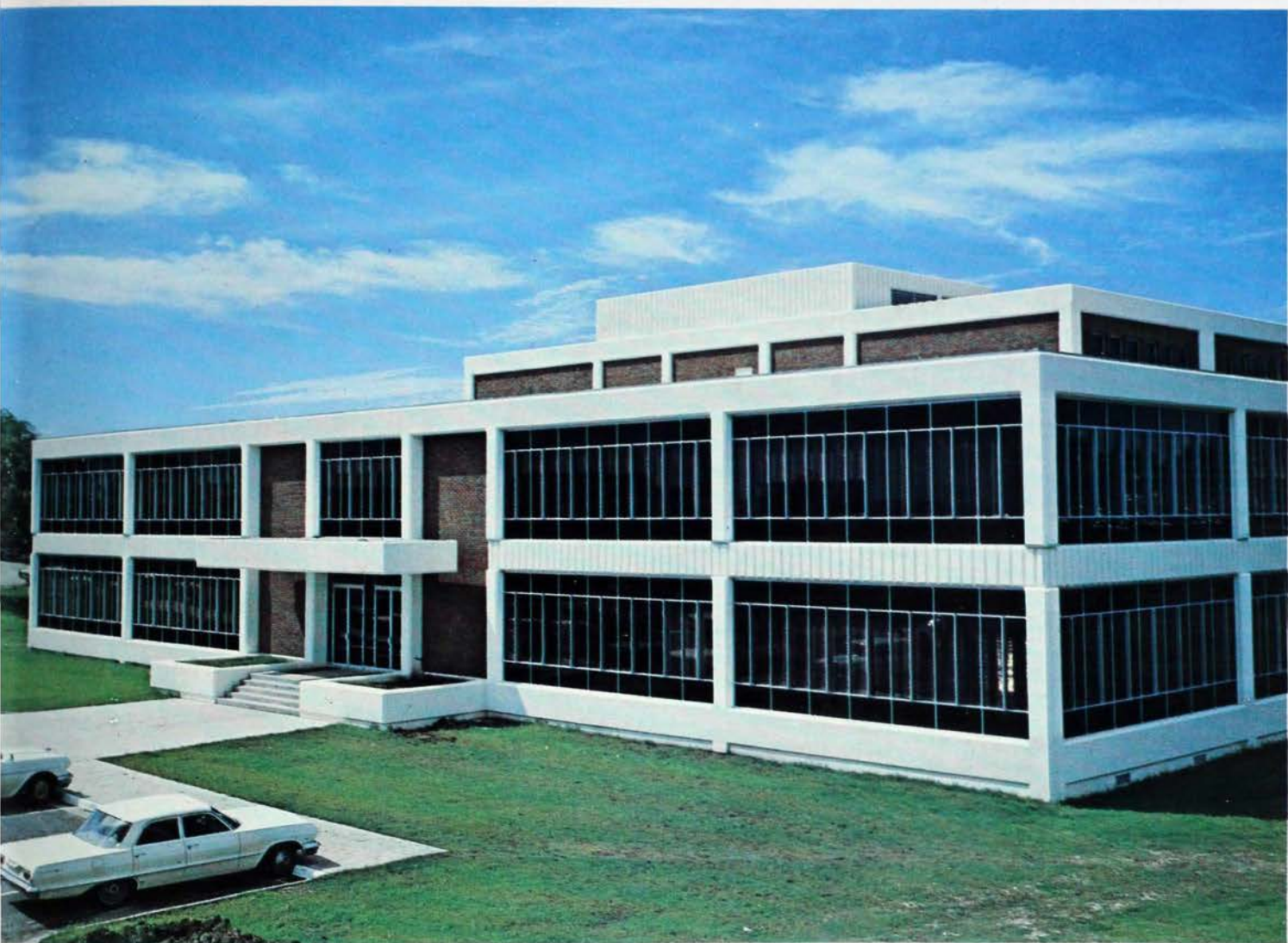
East Texas State University, Commerce, Texas

PROFESSIONAL BUSINESS ADMINISTRATION FRATERNITY