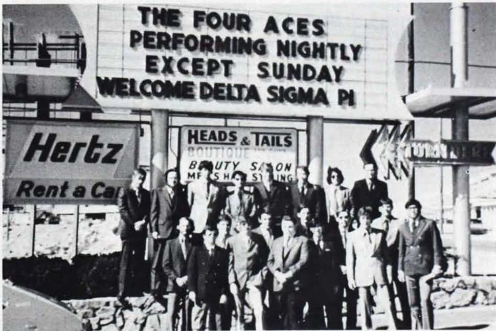
SHOWN HERE ARE the members of Epsilon Eta Chapter at Eastern New Mexico University and Gamma Phi Chapter at the University of Texas at El Paso during a joint professional tour recently held in El Paso, Texas.