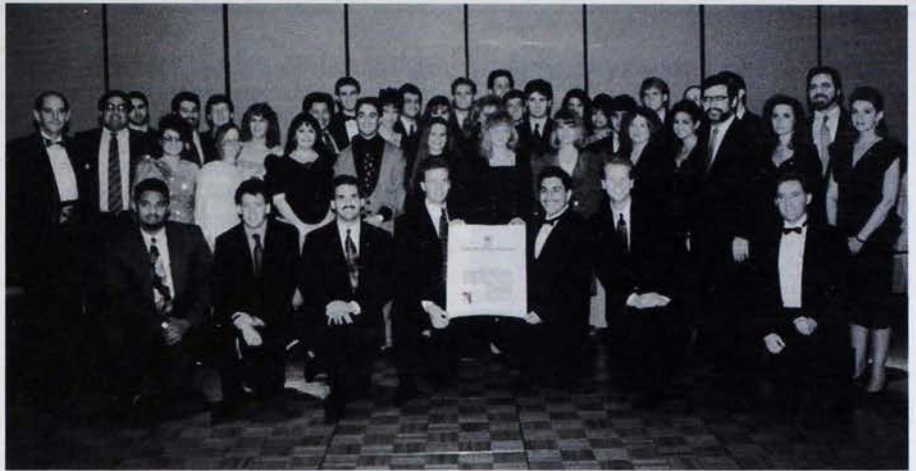
The newly initiated Brothers of Mu Chi Chapter gather with national officers following their installation.

A calendar of activities, outlining events planned through January of 1993 was submitted in October, 1992. Bylaws were received at The Central Office on November 2, 1992, and in November, 1992 their petition for a chapter charter was ap-