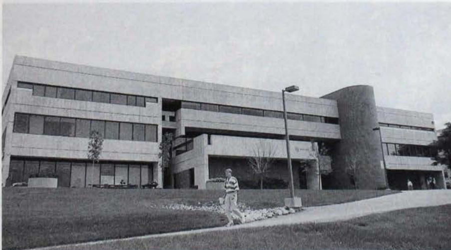
The College of Business building at the University of Colorado at Colorado Springs.

The College of Business was established at the University of Colorado at Colorado Springs in 1965 and is the only business college in Southern Colorado with American Assembly of Collegiate Schools of Business accreditation, and is one of about 300 nationwide with AACSB accreditation for its MBA program. Majors in the undergraduate program include Accounting, Finance, Information systems, Information Systems/Accounting, Organizational Management, Marketing, Personnel-Human Resources Management, Production/Operations Management, Public Agency Administration, and Small Business Management. MBA degrees are also offered in all of the above areas. Approximately 625 students are currently enrolled in the College of Business.