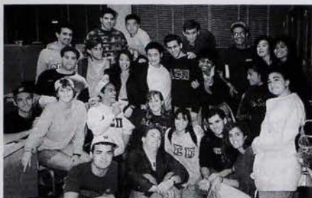
Brothers from Theta Pi Chapter after one of their recent chapter meetings.

NORTH FLORIDA, KAPPA PI —Kappa Pi Chapter recently celebrated its tenth anniversary. During the 1991-92 academic year, Kappa Pi Chapter also received four regional awards and two national awards.