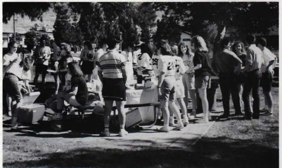
Brothers from Kappa Mu Chapter hold one of their recruiting functions at a local park.

CAL POLY-SAN LUIS OBISPO, KAPPA MU —Kappa Mu Chapter just initiated its 357th member, and the new Brothers from the Phi Pledge Class are proving that they share a special love for and dedication to Delta Sigma Pi. During their 12 week pledge period they took part in a city wide project to re-plant many trees in a park which had been destroyed by a fire. The pledge class was featured on the local news.