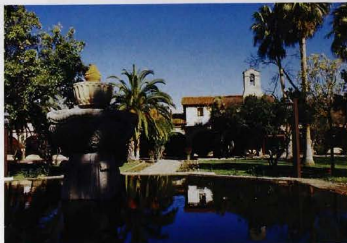
Mission San Juan

You may register for this and any other Optional Event using the registration form on page 21.