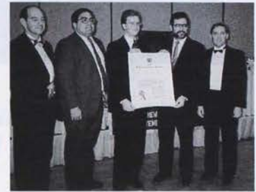
Page 12: Mu Chi Chapter Installed