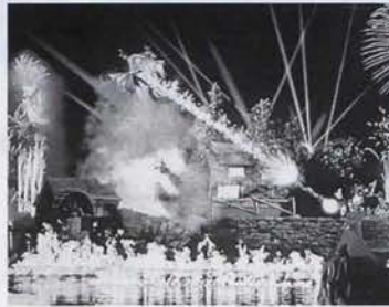
Page 4: Grand Chapter Congress