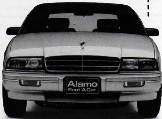
Alamo features fine General Motors cars like this Buick Regal

As a member, you'll receive other valuable coupons throughout the year that will save you money on each rental. You can count on a great deal with Alamo. For member reservations call your Professional Travel Agent or Alamo's Membership line at 1-800-354-2322.