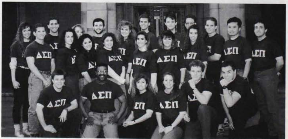
The Brothers of Epsilon Theta Chapter gather for a chapter photograph.