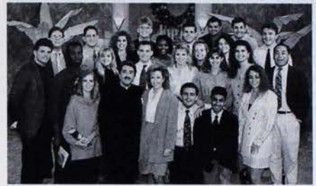
Brothers from Theta Phi Chapter on a professional tour of a local television station.

CALIFORNIA STATE -CHICO, EPSILON THETA —Epsilon Theta Chapter at CSU, Chico is paving new roads of success for our Brothers. to strive to be the best. Our chapter has benefited from numerous professional speak-