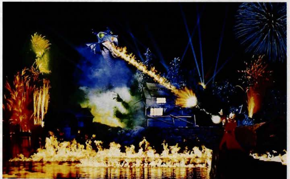
All photographs courtesy of the Anaheim Visitors and Convention Bureau.