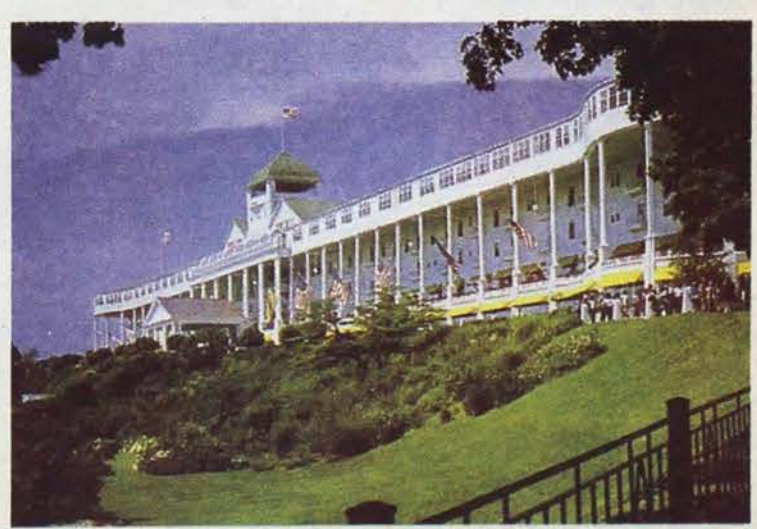
The Grand Hotel, Mackinac Island