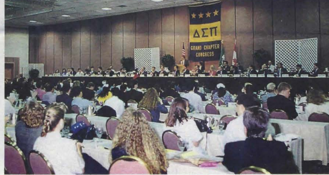
Collegiate and Alumni Chapter delegates participated in Business Sessions and considered numerous issues concerning the future of Delta Sigma Pi

On Wednesday, many more participants arrived and those