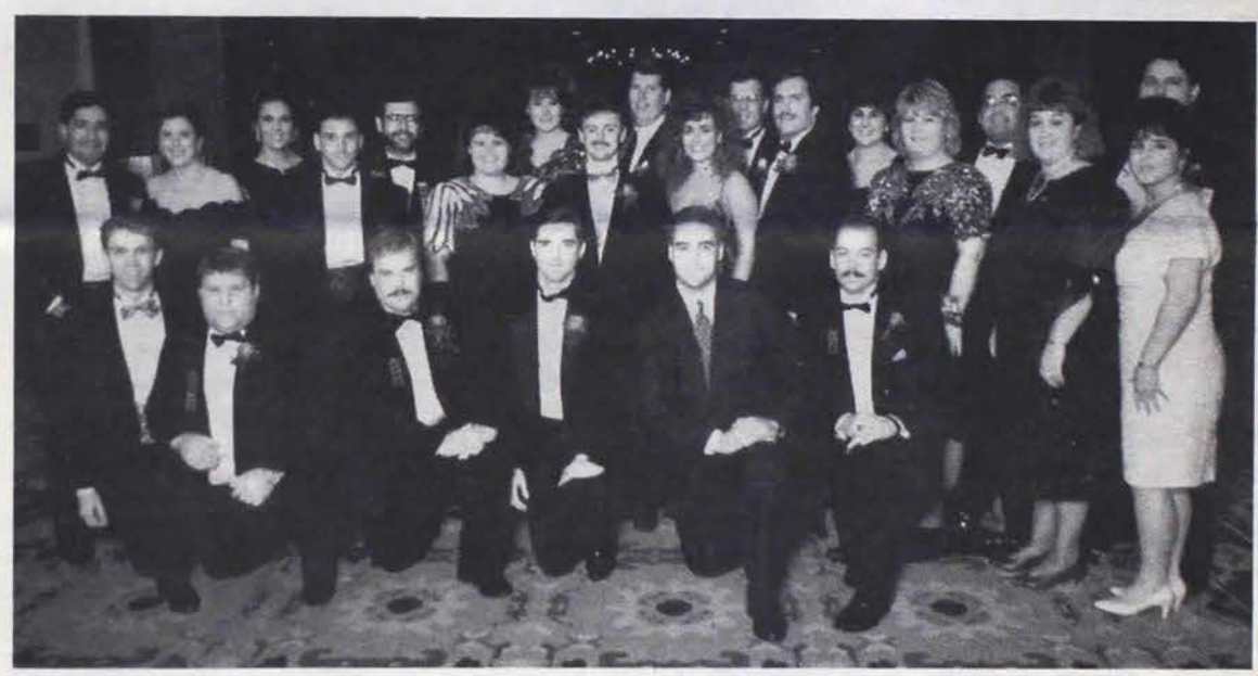
The new members of the Board of Directors gather following the closing Banquet at the Grand Chapter Congress