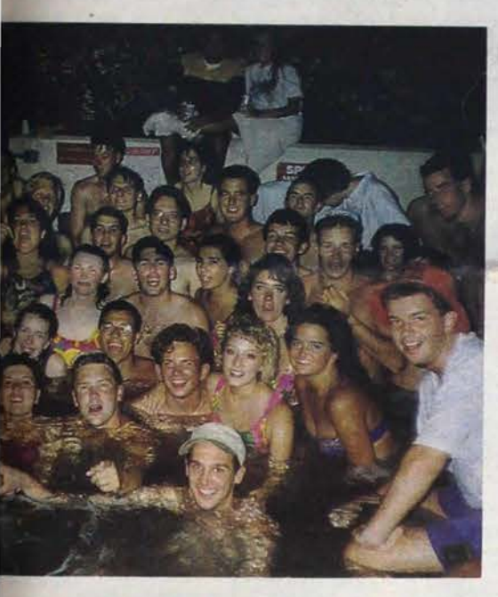
e swimming pool of the Anaheim Marriott Hotel