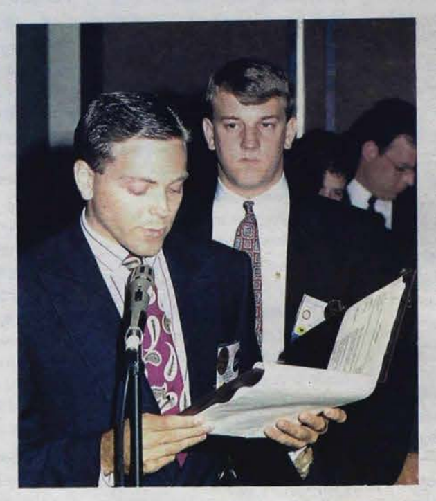
Delegates offered numerous recommendations and testimonials from the floor of the Grand Chapter