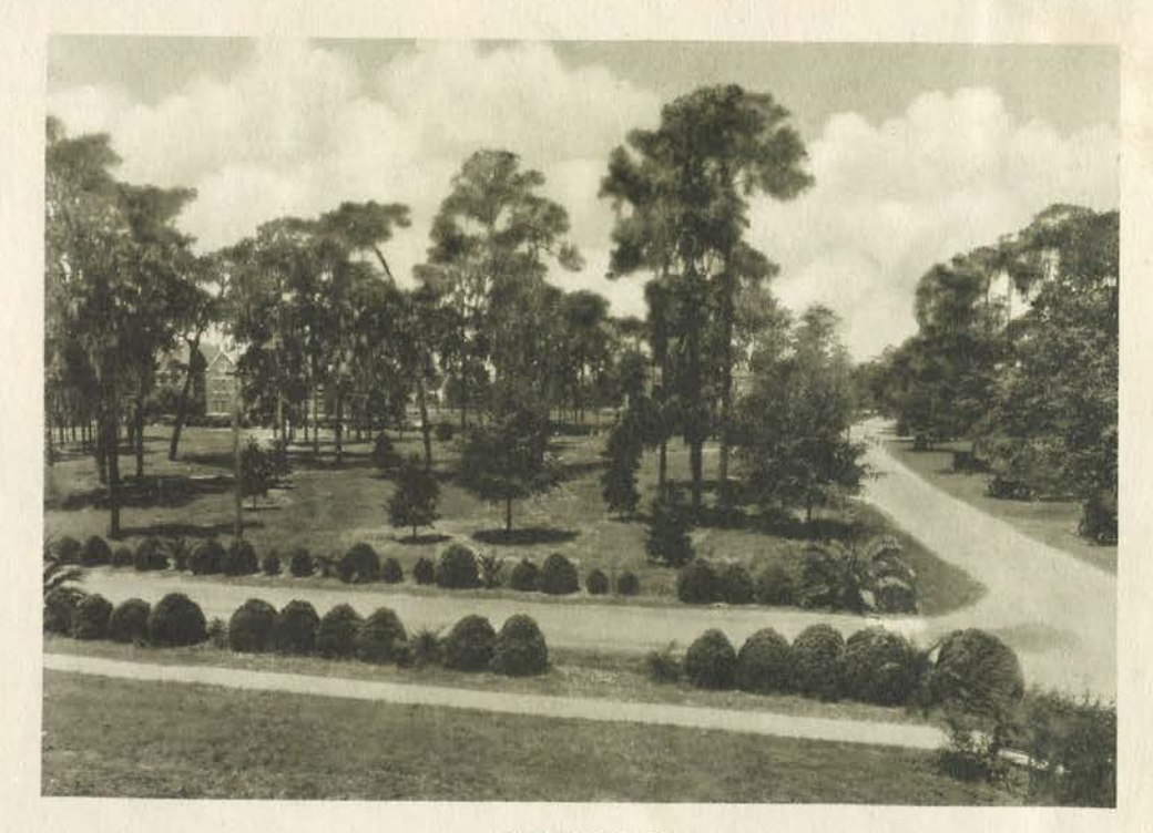
A CAMPUS SCENE