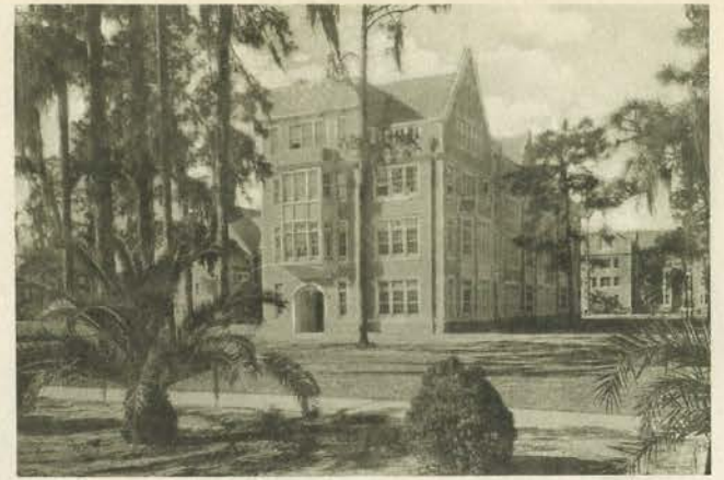
CHEMISTRY - PHARMACY BUILDING