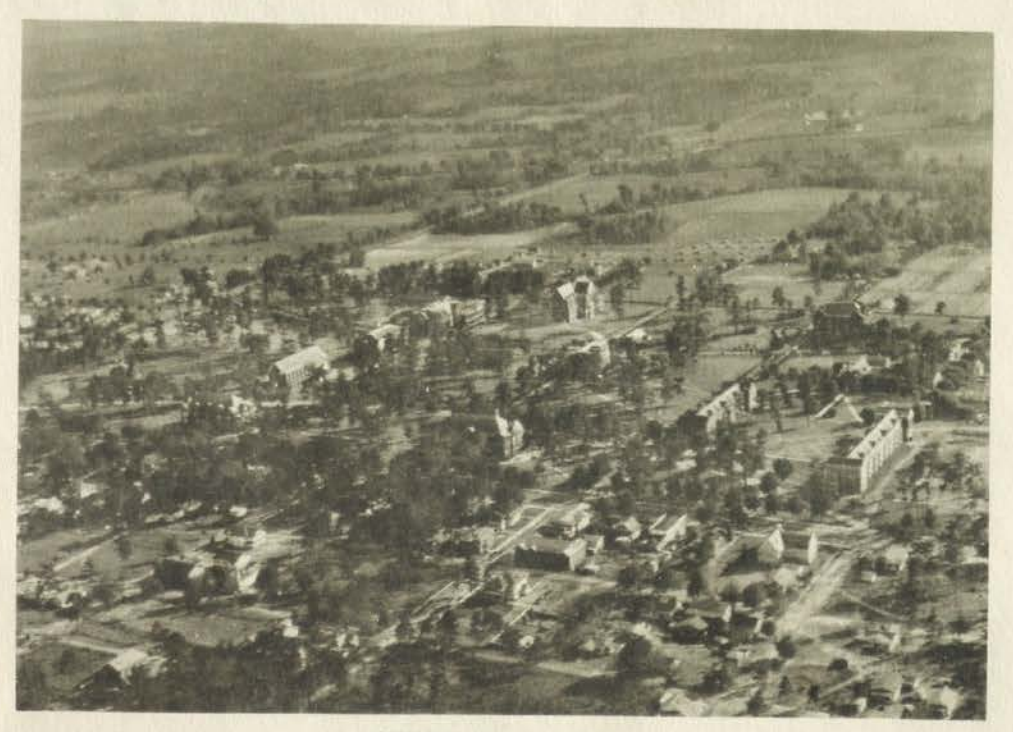
AIRPLANE VIEW OF CAMPUS