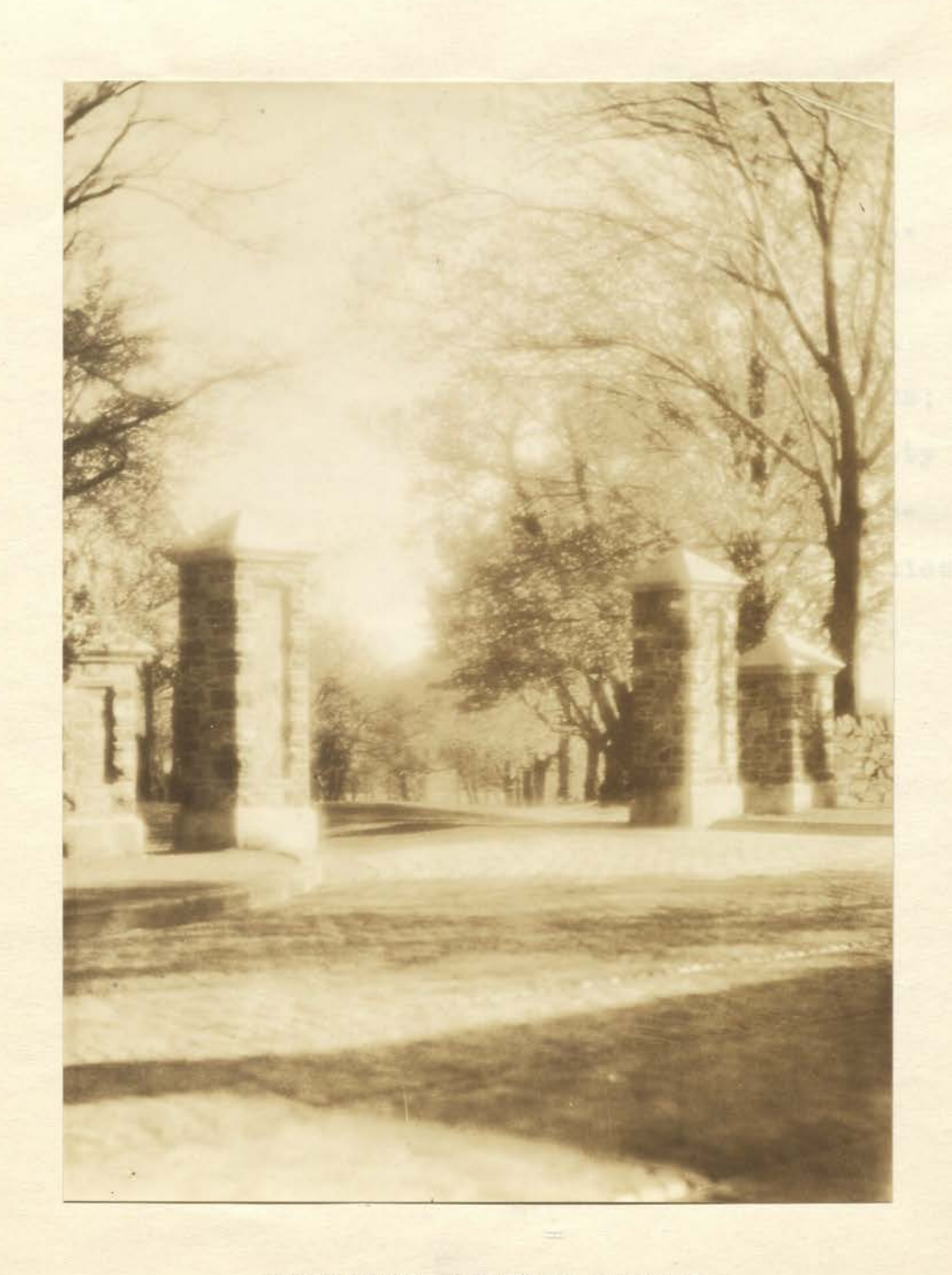
ENTRANCE: STUDLEY CAMPUS.