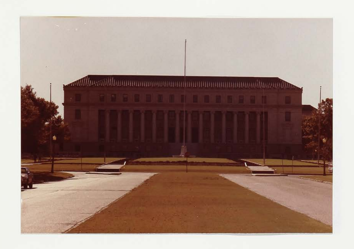
System Administration Building

The System Administration Building was designed by S. C. P. Vosper, a staff architect. A brass and terrazzo inlaid map of Texas is located in the main lobby. The terrazzo indicates the different major soil types in Texas and the brass inlays recall incidents of historical interest. There is one error in the map--Austin is located on the wrong side of the Colorado River.