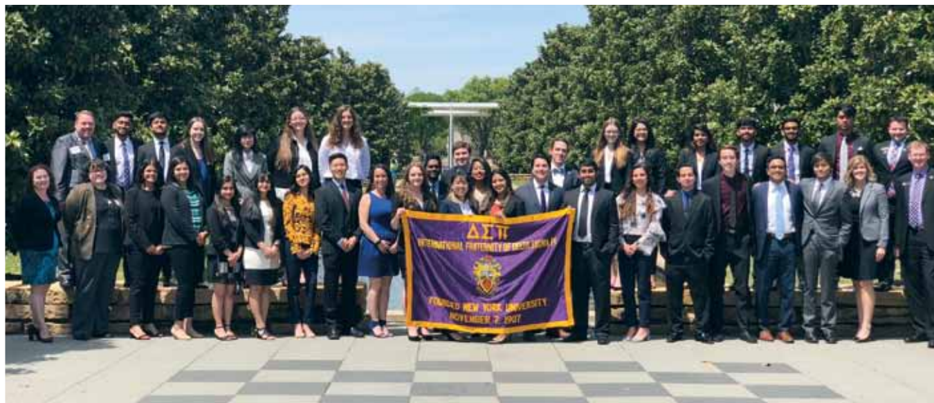
Members of Chi Psi Chapter at Texas-Dallas take their first picture as a newly installed chapter on campus.