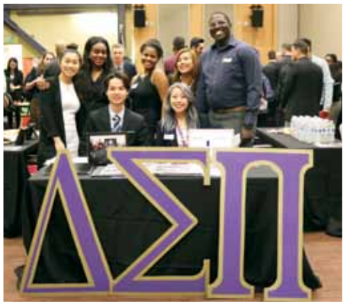
CAL STATE-EAST BAY hosted a Career Expo in February, where they had 16 companies present about working for their company and how best to get hired.