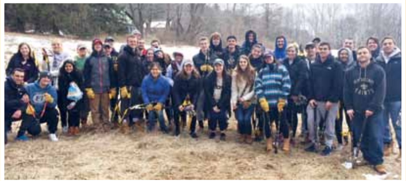
CONNECTICUT supported Joshua's Trust, Northeast Connecticut's largest land-holding organization, by removing invasive plant species, maintaining trails, and learning about factors threatening the area.