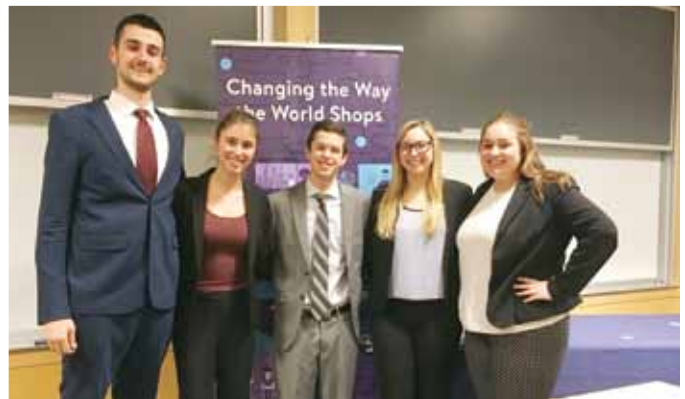
PENN STATE-STATE COLLEGE brothers competed in a Walmart Case Competition on campus and had the opportunity to take part in a real business scenario, taking away time management skills, communication techniques and public speaking experience.