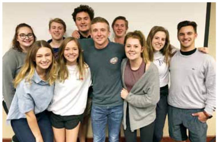
ST. THOMAS (MN)'s executive committee set a goal this year to emphasize the term 'potential' and plan events/recruit talent that helped the chapter and its members reach their highest potential.