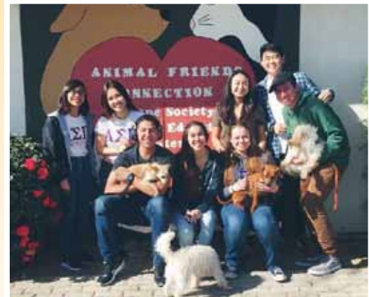
PACIFIC (CA) volunteered at Animal Friends Connection Humane Society in Lodi, Calif., spending quality time with the animals for adoption there.