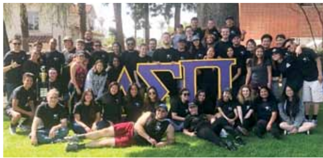
LA VERNE (CA) hosted the annual South Pacific Regional inter-chapter event, called Sharkfest. Brothers played flag football and capture the flag. Participating chapters were from CAL STATE-LONG BEACH, PEPPERDINE (CA), CALIFORNIA LUTHERAN and POMONA VALLEY ALUMNI.