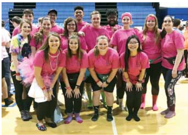
INDIANA STATE created a team for "STATEDM", the Dance Marathon for Riley Children's Hospital across Indiana. Brothers have been raising money throughout the year, which culminated with the main event where they stood/danced for 12 hours in honor of those who cannot. Altogether, the university raised more than $200,000 for the hospital.