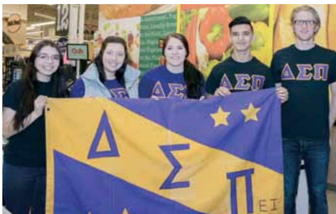
MINNESOTA STATE raised more than $700 bagging groceries at their local Cub Foods!