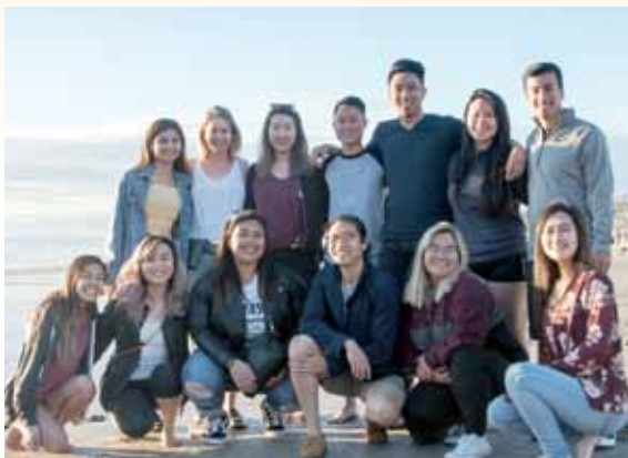
SAN JOSE STATE brothers spent some time on the beach during the weekend of the San Diego LEAD School.