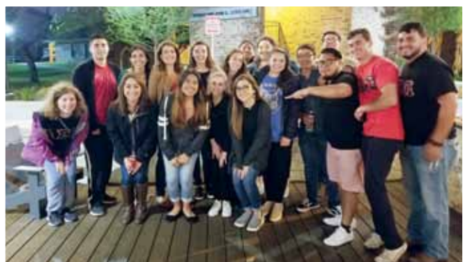
ST. MARY'S (TX) celebrated 30 years since their installation. The chapter had a BBQ and cake for the chapter's "birthday."