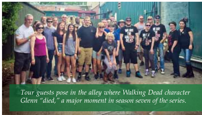
Tour guests pose in the alley where Walking Dead character Glenn "died," a major moment in season seven of the series.

The relationships and experiences I've had as a brother have only enhanced my networking and business relationships. Atlanta has a huge Deltasig alumni base and it's super easy to connect with friends and brothers all over the city. My time as a Deltasig leader has also taught me additional time management skills as I have to work on allocating volunteer time more appropriately since nothing really slows down with a small business. I love being a part of the national leadership team and encouraging current and future alumni to become the next generation of leaders. I always wish I had more time for the Fraternity, but we tend to be our own worst critics and knowing your limits and acting within them is a balancing act everyone has to find for themselves.