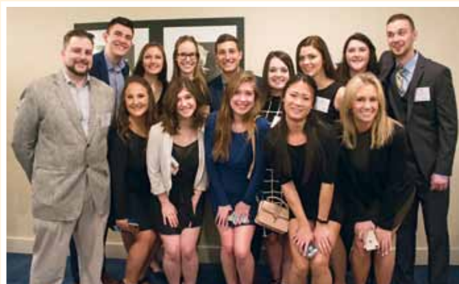
Brothers who attended the LEAD in Milwaukee learned a great deal about risk management, pursuing passions and the impact of social media profiles on job searches.

Be sure to check out the 2018-19 schedule – we hope to see you at an upcoming event near you! ▲