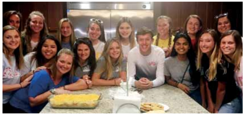
FLORIDA SOUTHERN brothers partnered with Alpha Delta Pi Sorority to make cards and cook for the families staying at the Tampa Ronald McDonald House.