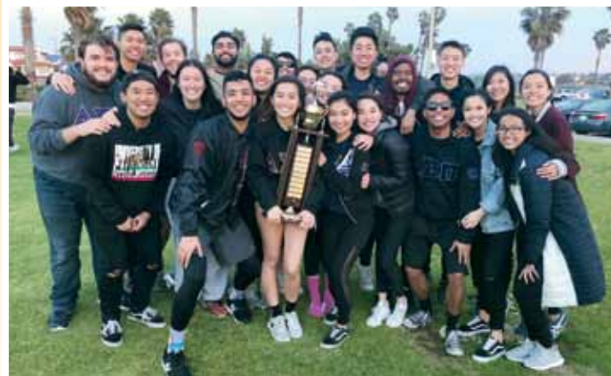
CALIFORNIA-RIVERSIDE took first place overall during the Pacific Coast Regional Brotherhood Games at Mission Beach in San Diego. Brothers competed in volleyball, basketball, trivia and a relay race.

Share news of your collegiate chapter's activities and events with brothers across the country! Email news and photos to magazine@dsp.org