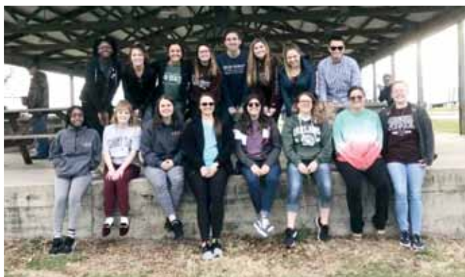
MISSOURI STATE hosts an Easter event for the children at Safe Haven of the Ozarks every year. Safe Haven is a local shelter that provides a safe environment for children in foster care and private custody disputes.