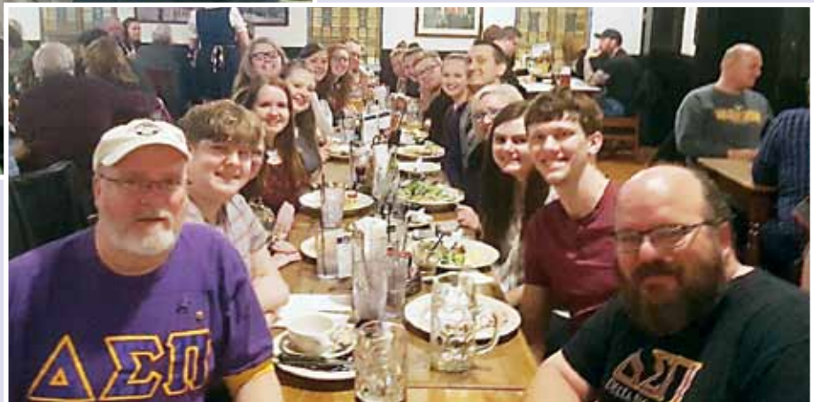
CINCINNATI ALUMNI welcomed South Dakota brothers to Cincinnati while in town for a professional trip. (See picture of SOUTH DAKOTA at Central Office in On Campus).